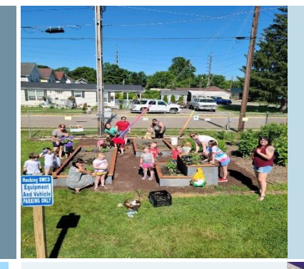
General Public Program 39 Events 2,546 Participants