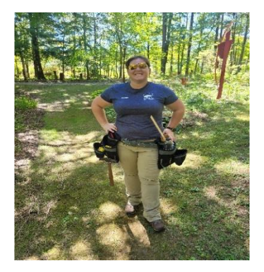
Wildlife Specialist Technical Assistance 53 BMP's 68 Acres 66 Participants