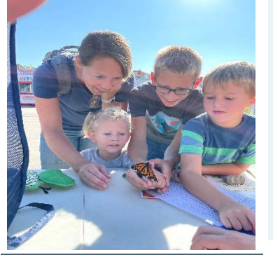
Non School Related Program 6 Events 84 Participants

Programs for Professionals 3 Events 63 Participants