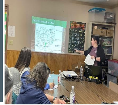
Educator Workshop 2 Events 25 Participants