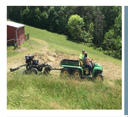
Farmer/Landowner Program 11 Events 247 Participants