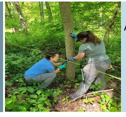
Agricultural/Resource Conservation/Water Quality 7 Events 47 Participants