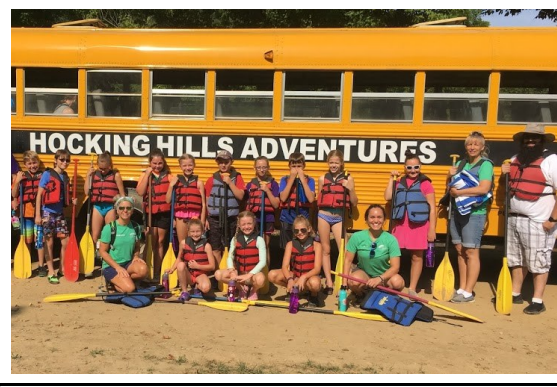
Hocking Adventure & Discovery Camp