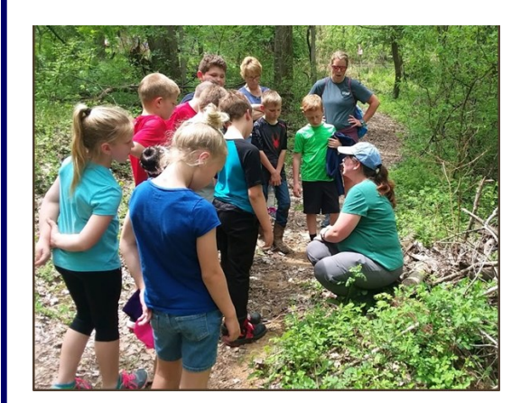
Field Trip at Bishop Educational Gardens

An Affiliate Membership assists the Hocking Soil and Water Conservation District's education and outreach efforts.